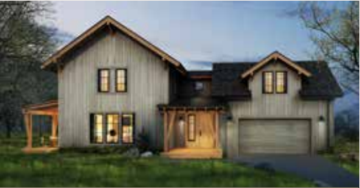
BORAH 2,680 SF / 4 Bed / 3.5 Bath