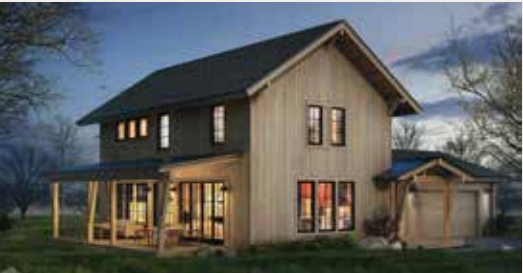
SCOUT 2,300 SF / 3 Bed / 2.5 Bath