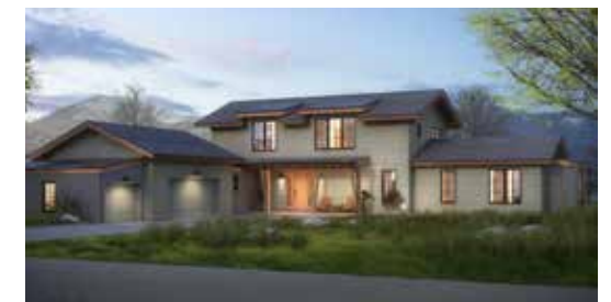
ANGLER 2,875 SF / 4 Bed / 3.5 Bath