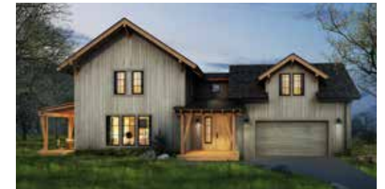
BORAH 2,651 SF / 4 Bed / 3.5 Bath Lot 117 / 451 Hunters View Ln. $2,200,000