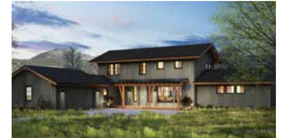
ROOSEVELT 2,874 SF / 4 Bed / 3.5 Bath Lot 114 / 434 Hunters View Ln. Under Contract